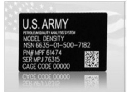
Part Mark, Label or Plate